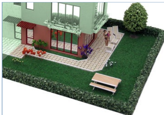
Apartment Una 'a'