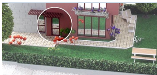
Private front door