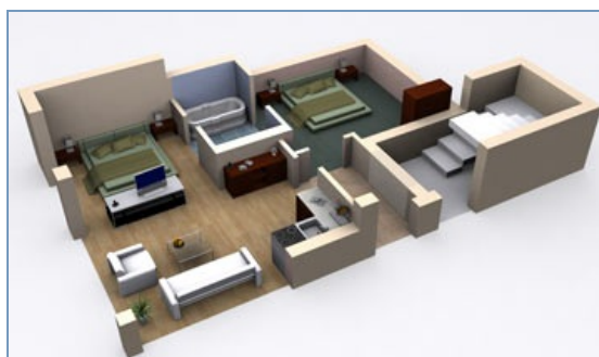
Apartment Duo 'a'