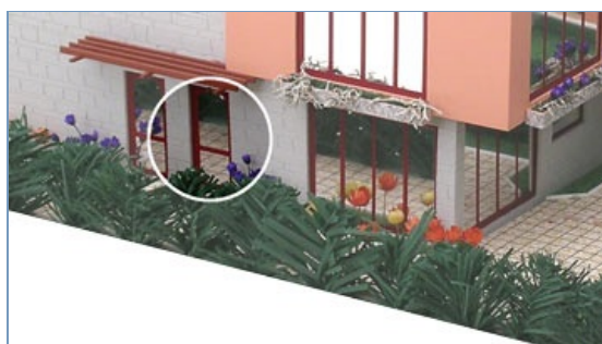
Private front door