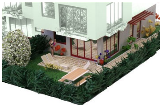
Apartment Duo 'a'