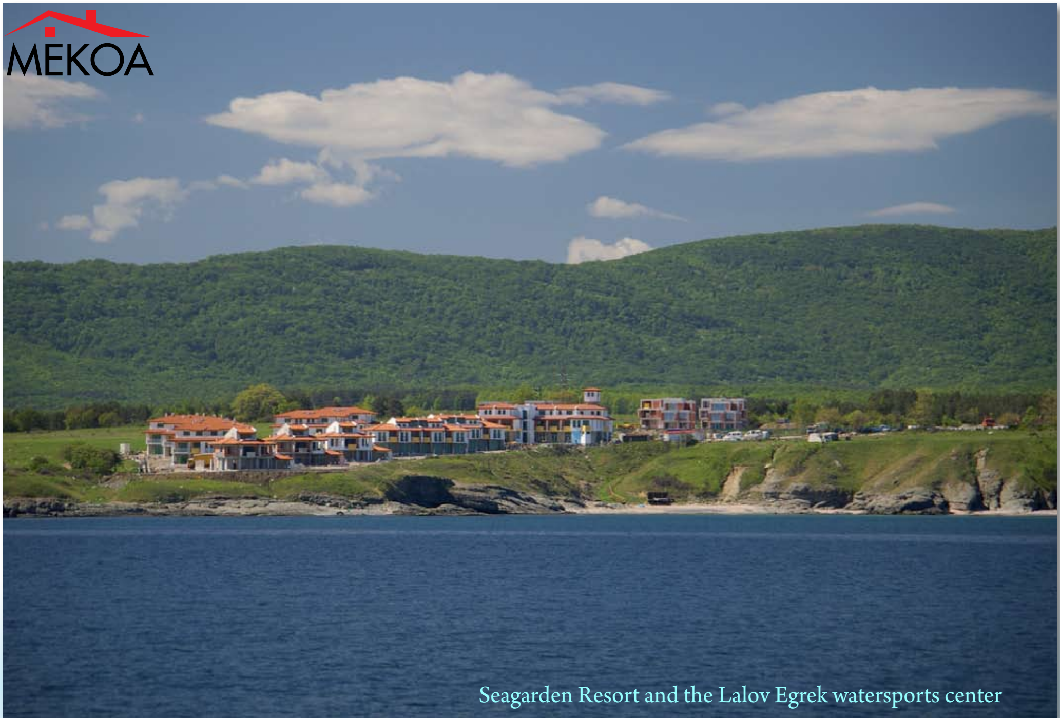
Seagarden Resort and the Lalov Egrek watersports center